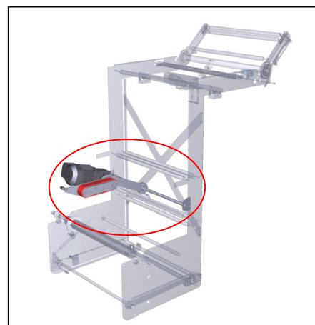
film reel support with motor-driven unwind device

We will gladly prepare an offer for installation and commissioning of the device on site at your ROVEMA machine (duration approx. 1 day).