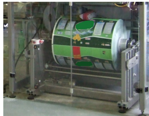
view lifting device in a ROVEMA form, fill and seal machine

We will gladly issue an offer for installation and commissioning (duration approx. 1 day plus travel time) on site at your ROVEMA machine. The lifting device can be retrofitted on all ROVEMA form, fill and seal machines (also if integrated in a SBS or CMV machine).