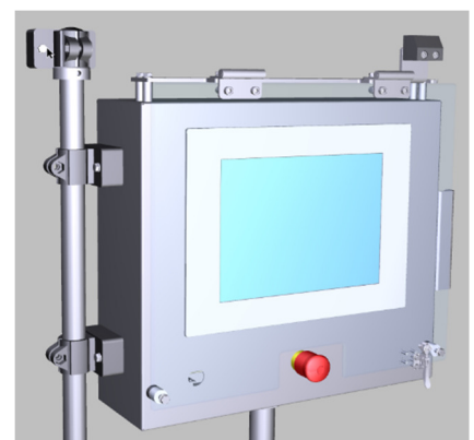
operator display with protective cover

The protective cover can be retrofitted on all ROVEMA machines with an operator display with monitor.