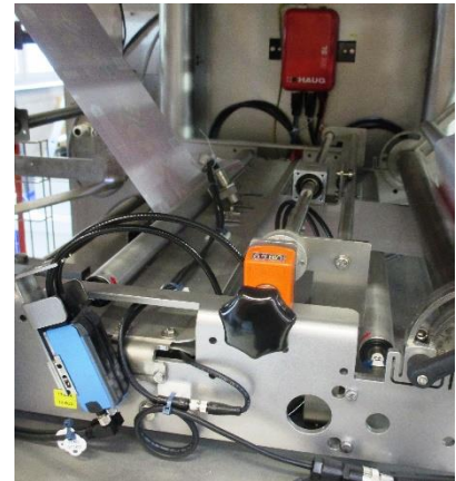
adjustment unit for film edge control in ROVEMA form, fill and seal machine