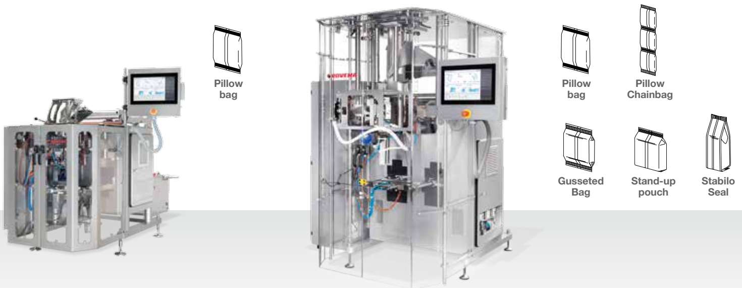
BVC 250 Compact

The Form Fill Seal machines of the BV series can easily and safely be operated with the smart ROVEMA P@ck-Control software. The intuitive touch operation enables the smooth adjustment of all operator inputs that are important for the packaging process: sealing time, sealing force, bag length and set output. Based on these parameters the machine automatically calculates the optimal operating settings. The